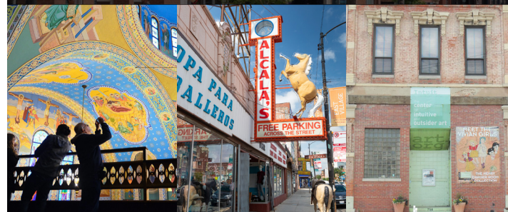
Saints Volodymyr & Olha Ukrainian Catholic Church