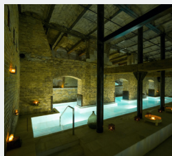
AIRE Ancient Baths