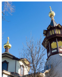
Holy Trinity Orthodox Cathedral

By 1900, Polish immigrants staked a major claim in the neighborhood, transforming the intersection by Division and Ashland (where you'll find the Division Blue Line 'L' stop) into Chicago's "Polish Downtown." Since then, Russian Jews, Italians, Ukrainians, Puerto Ricans, and Mexicans have all made West Town home, adding to the neighborhood with restaurants, museums, and churches reflecting their cultures.