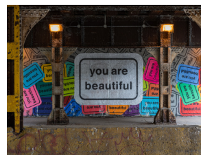
Mile of Murals

Rogers Park is also home to a burgeoning theatre scene, home to both long-standing institutions like The Factory Theatre (creating original shows for 25 years) and newcomers like The Rhapsody Theater (bringing magic, cabaret, and more to a historic space) and Le Piano (jazz club serving small plates, global fare & cocktails).