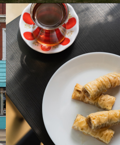
Tosini Turkish Street Food