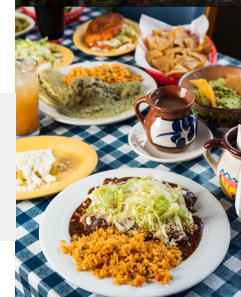
El Sabor Poblano