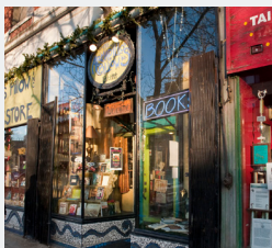
The Armadillo's Pillow