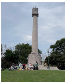
Illinois Centennial Monument

The boulevard is anchored by the soaring Illinois Centennial Monument , designed by the same architect who created the Lincoln Memorial in Washington D.C. It'll lead you straight to Palmer Square , where you'll find residents lounging in the grass with a frozen treat from a seasonal spot Miko's Italian Ice . Once a popular raceway for nineteenth-century carriage drivers and cyclists, this green space is a quiet getaway in the Logan Square neighborhood.