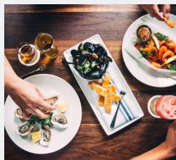
Longman & Eagle