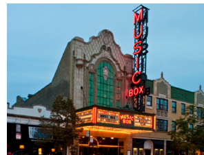
Music Box Theatre

Dear Margaret has earned Michelin acclaim for its French-Canadian cuisine, and BITES Asian Kitchen serves up sushi, ramen, baos, and Asian-inspired tapas.