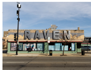
Raven Theatre Company

Edgewater's multicultural community has a strong influence on the vibrant arts, theatre, and music scene. With over twenty theatre companies based in Edgewater, the neighborhood is a hotbed for the kind of theatre that's put Chicago on the map.