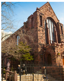
Church of The Atonement

Dive into Edgewater's history at the Edgewater Historical Society , a neighborhood museum and society that is collecting and preserving the memories and histories of the residents of Edgewater. The museum is housed in a renovated Chicago firehouse and contains exhibits about local history, including the famous Edgewater Beach Hotel. Visitors may also learn about the three historic districts of Edgewater: Lakewood Balmoral, Bryn Mawr, and Andersonville.