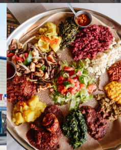
Ethiopian Diamond Restaurant & Bar