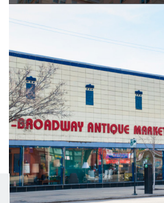
Broadway Antique Market