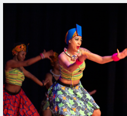
Kehrein Center for the Arts