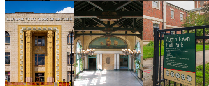
Laramie State Bank Building