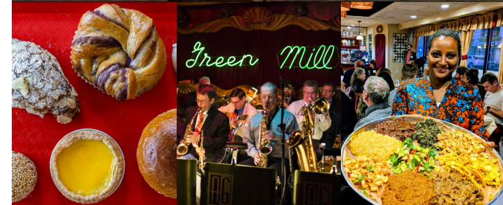
La Pâtisserie P