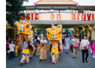
Asia on Argyle Night Market

ASIA ON ARGYLE On Argyle Street and the surrounding blocks, you'll find a treasure trove of Southeast Asian eateries, with restaurants serving up sushi, dim sum, banh mi, pho, and more. One local favorite is James Beard Award-winning Sun Wah BBQ, where the Beijing duck dinner is an off-menu hit.