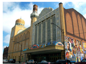
New Regal Theater

Inside, you'll find a rich array of cultural programming, a restaurant run by the in-house culinary institute, and a theater that hosts a variety of community groups like the South Shore Opera . The center is also home to the annual South Shore Summer Festival .