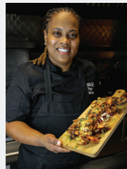
Lexington Betty's Smokehouse