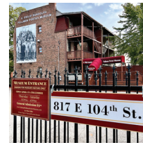
A. Philip Randolph Pullman Porter Museum

Visitor Center , where you'll find artifacts from Pullman workers, a 3D model of the town's original layout, and even a full-sized model of the luxurious Pullman sleeper car! Swing past the Hotel Florence . Named after Pullman's oldest daughter, the grand hotel was once filled with luxurious suites, a barber shop, a billiard room, and the community's only bar. Step onto the large Victorian porch and take a peek inside (renovations are ongoing). On 111th Street , you'll find an interesting mix of homes and architecture. The most prestigious residences, housing the senior executives, were along 111th Street because this location offered the shortest walk to work. As you walk further south, you'll find progressively more humble residences that housed different levels of employees.