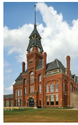
Pullman National Historical Park

George Pullman, a luxury railcar tycoon and president of Pullman's Palace Car Company, dreamt up the idea of a planned community to house the employees who built his luxury rail cars. The community consisted of more than 1,300 original structures including a factory complex, workers cottages, parks, and markets, plus a bank, library, church, and even an 800-seat theater. While Pullman's vision was brought to life by 1884, his model town wasn't enough to quell unrest among his employees. In 1893, a significant economic recession hit, and Pullman cut wages — without lowering rent on the company-owned housing. This led to the Pullman Strike, which escalated into a national railroad boycott and was a crucial event in the early labor rights movement.