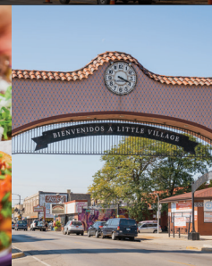
Arco de Villita