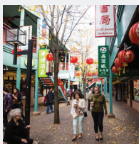
Shopping in Chinatown Square