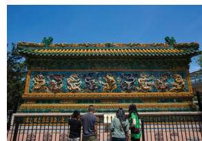
Nine Dragon Wall

Chinatown's main stretch along Cermak Road and Wentworth Avenue is where you'll find retail, restaurants, detailed architecture, and more. Pop into the colorful storefronts to shop for exotic teas, handmade ceramics, hard-to-find beauty products, unique jewelry, and more.