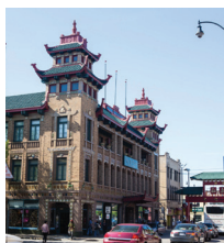
Pui Tak Center

Chicago in the 1870s and began moving to the South side in the 1910s. During this era, Chinatown provided support and economic opportunity for its residents and began attracting visitors from nearby neighborhoods and far away places. The On Leong Merchants Association represented the community, assisted new immigrants, organized cultural events, and contributed to the thriving community it is today. You can see the Association's legacy still standing at the historical landmark Pui Tak Center (formerly On-Leong Merchants Association building). The building is known for its Chinese architecture, like the pagoda-style entrance and ornate roof, and used to be called "Chinatown City Hall".