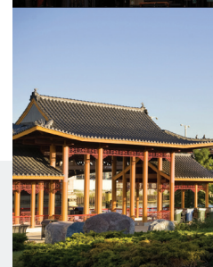
Ping Tom Park