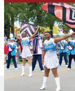
Bud Billiken Parade