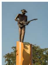
Chicago's 47th Street

This community is known for its rich history and a flourishing, modern-day renaissance. Bronzeville's cultural contributions are vast — it was once home to Pulitzer Prize-winning poet Gwendolyn Brooks, civil rights activist Ida B. Wells, legendary musicians Louis Armstrong, Nat King Cole, and more.