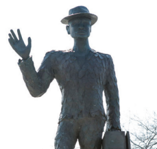
Monument to the Great Migration

In the midst of all its rich history, look for striking public art installations, like the sculpture-adorned stretch of Martin Luther King Drive that features a Monument to the Great Migration . This bronze statue commemorates the thousands of African-Americans who fled the Jim Crow South and arrived in Chicago in search of freedom and opportunities. Clutching a battered suitcase, the statue represents the migrants who built this culturally rich neighborhood.