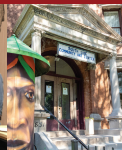
Southside Community Art Center