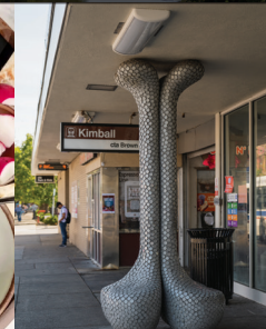
Kimball Brown Line