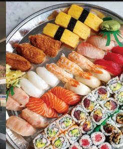
Lawrence's Fish Market