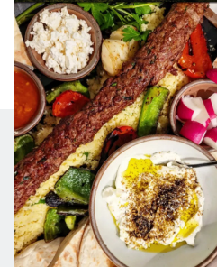
Sahar International Market