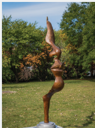
Ronan Park Sculpture Park & Healing Garden