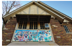
Albany Park Theater Project

The neighborhood's global influence extends to its cultural scene, too. The Albany Park Theater Project is the recipient of numerous accolades, with a diverse team creating original productions that perfectly represent the neighborhood's inclusive spirit. Albany Park Community Center, 2nd Story, TUTA Theater , and many other organizations add to the neighborhood's dynamic artistic community.