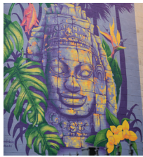
Cambodian American Heritage Museum

Another large part of Albany Park's history includes its access to the riverfront and outdoor activities. The neighborhood has grown from a small farming community in the early 1800s to hosting some of the biggest parks in the area. Stroll along the neighborhood's scenic waterfront at River Park and Ronan Park . River Park is a 30-acre green space home to a wildlife habitat, fishing spots, a canoe launch, and an interactive water playground. Ronan Park contains a river path, perfect for bird watching, and several works of public art that celebrate the community's multicultural heritage.