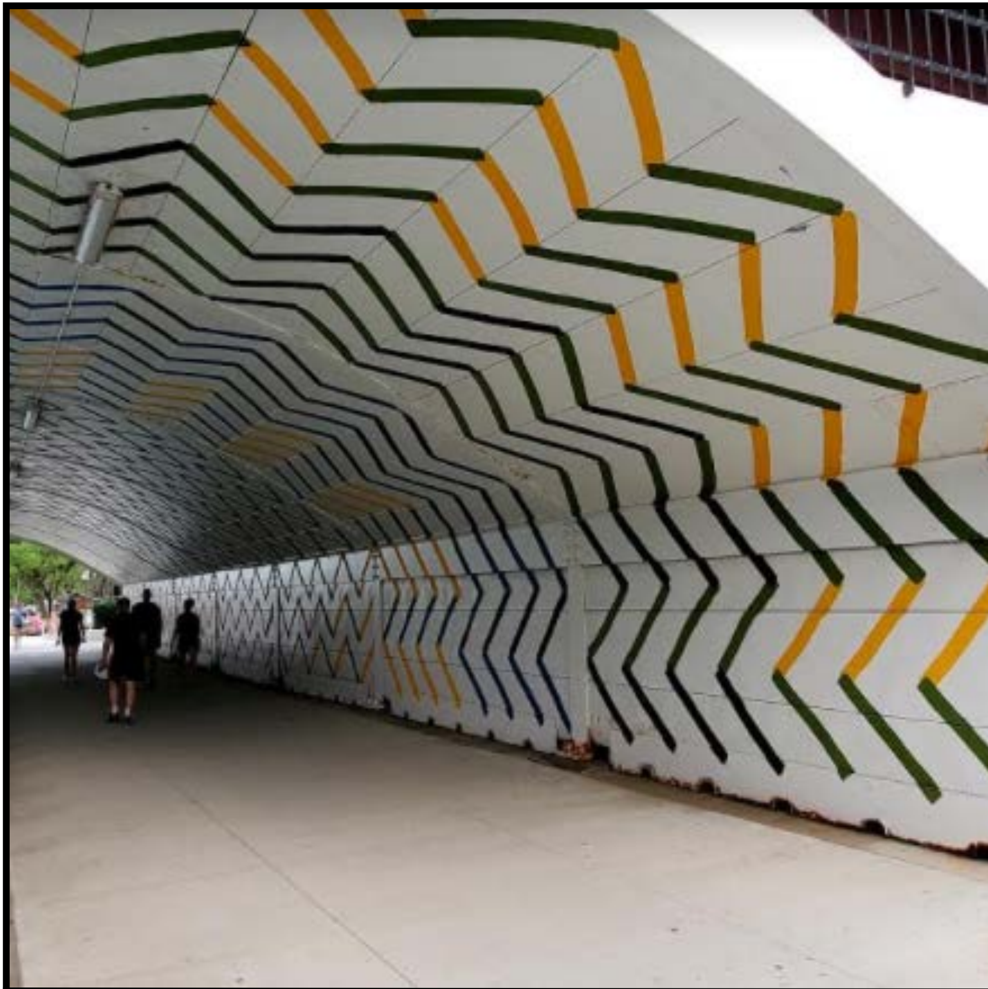
COLUMBUS ST BRIDGE MURAL

Continuing west, each section between the bridges west of Michigan Avenue has a different function.