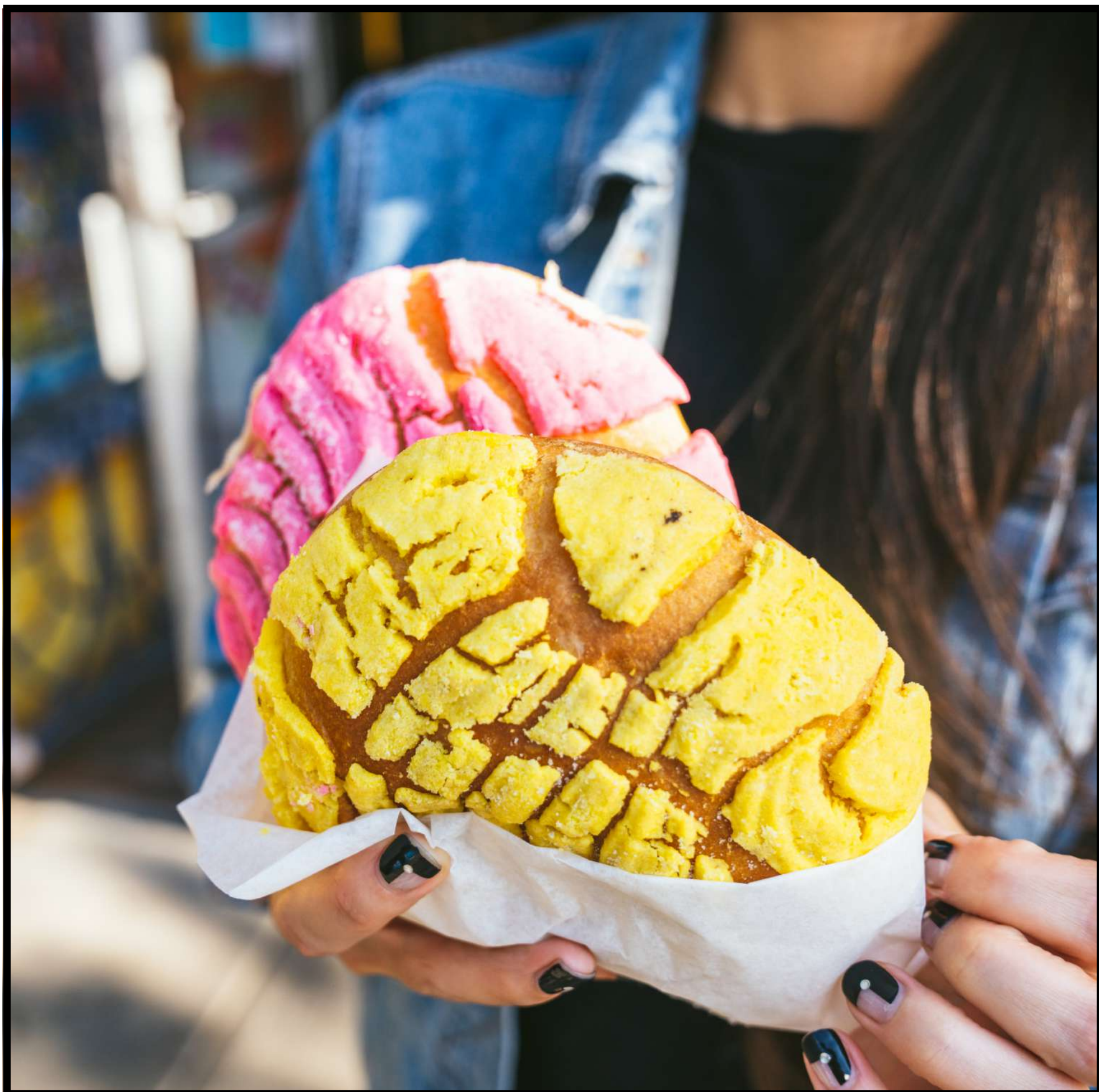
PANADERIA DEL REFUGIO